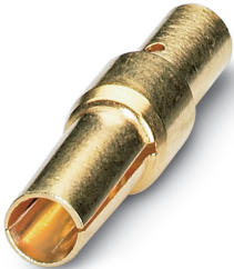
Crimp contact, turned, contact diameter: 2 mm, crimp range: 1 mm 2 ... 1.5 mm 2

Please be informed that the data shown in this PDF Document is generated from our Online Catalog. Please find the complete data in the user's documentation. Our General Terms of Use for Downloads are valid ( http://phoenixcontact.com/download )